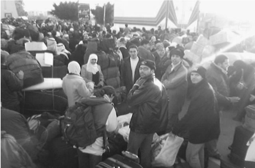
Gaza Strip students trapped on “Rafah” border on their way back to Gaza

national and international levels. Funds were provided by NORAD 1 , NETF 2 , SOIR 3 and ABCD 4 through a variety of means to help these students continue their journey in education and finally be able to graduate as certified Occupational Therapists in March 2008. Support and collaboration between BU teachers and graduates has continued to make sure that these graduates feel safe, confident and stable in their practice and their profession as successful health service providers.