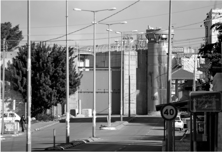
Rachel's Tomb, entirely covered by the Wall, as seen from the Bethlehem side.