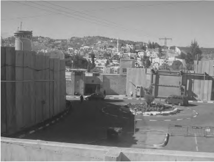
Entrance to the Tomb of Rachel, January 2010.