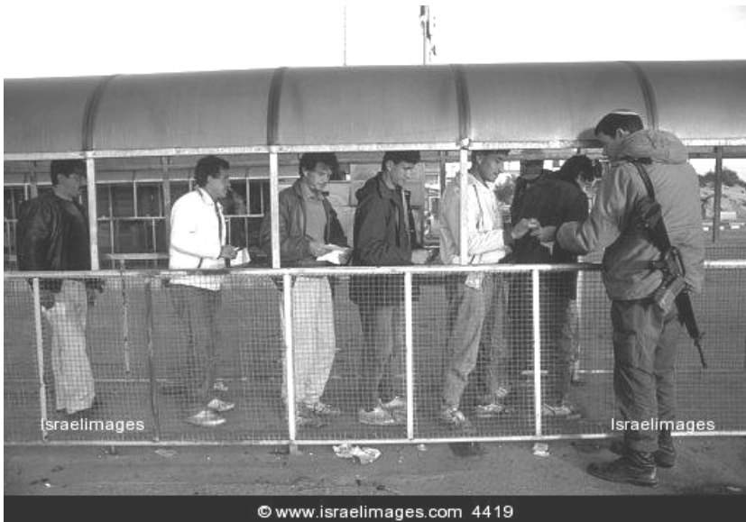
People standing in line: EREZ Checkpoint

occupational therapy. At this stage external support and some public actions were needed. As a result, there was a call for a case-trial against the Israeli government for its refusal to issue permission for students to come to Bethlehem and join their classmates. An Israeli Human rights Organization called GISHA took legal action against the Israeli government and worked on the case until the last minute to make this a dream come true. Unfortunately, they failed and lost the trial and the case was adjourned until the end of the fourth year of study.