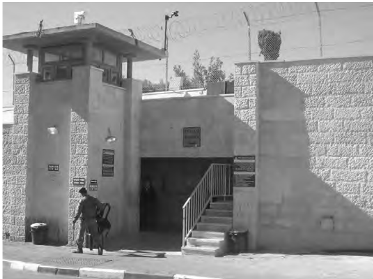
The site of Rachel's Tomb within the Walls, January 2010.