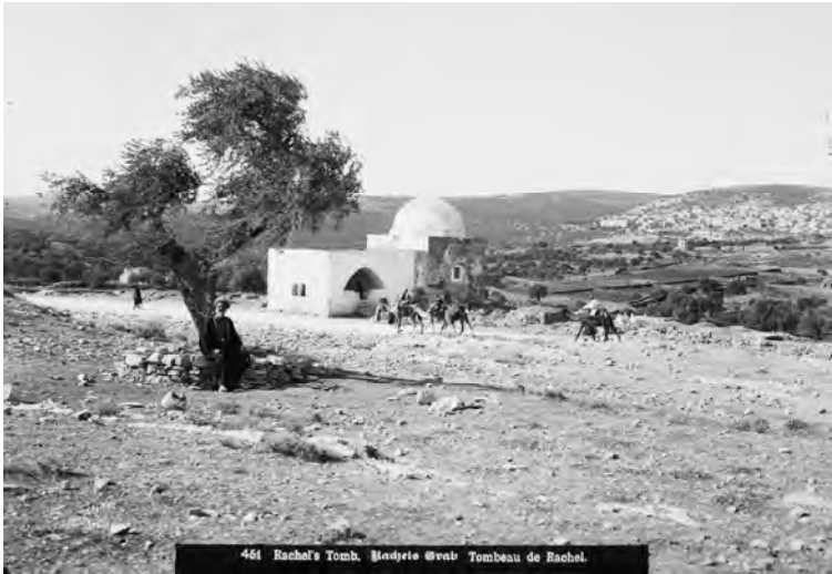
Rachel's Tomb in early 19th century

and thus turning it into a nearly virtual site. Rachel's Tomb is no more tangible and no more accessible for Palestinians, Christians and Moslems alike.