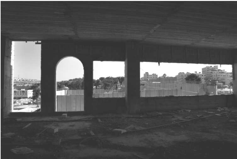
The site of Rachel's Tomb now encircled by a complex wall structure as seen from a house in Bethlehem.