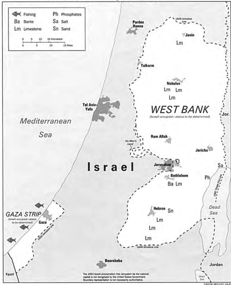
Maps of Palestine, Selected Natural Resources, January 1994 http://www.lib.utexas.edu/maps/middle_east_and_asia/natural_resources.jpg

The plan was that ten students from Gaza would be selected and brought up to Bethlehem city to live and study for 4 years, with a condition to return and to serve the people of Gaza especially as only two occupational therapists existed at that time in the whole Gaza Strip. For the reader to get a sense of