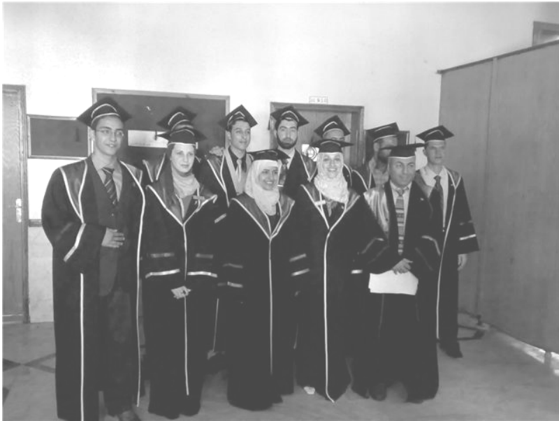
Graduation of the ten OT students in Gaza

Salle Christian Brothers opened schools in Bethlehem, Jerusalem, Jaffa, Nazareth, Turkey, Lebanon, Jordan, and Egypt. It offers two Masters programs, seventeen Baccalaureate degree programs, and seven Diploma programs. Its mission is to provide quality higher education to the people of Palestine and to serve them in its role as a center for the advancement, sharing and use of knowledge. Relating to its mission and since Gaza Strip is a part of Palestine and its needs ought to be addressed as much as other areas, the university positively answered this need and opened its doors accepting ten students in the occupational therapy program so they can serve the people of Gaza Strip